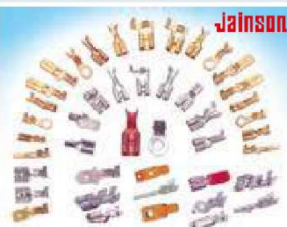
SNAP ON TYPE TABS