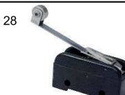
Medium Plain Lever with Roller ( Reverse Acting )