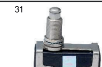
Auxilliary Panel Mount Plunger