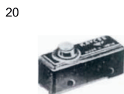
Compact Overtravel Plunger