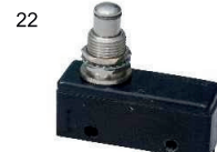
Panel Mount Plunger