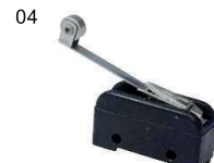
Plain Roller Lever ( Direct Acting )