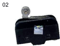
Short Roller Lever