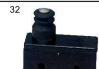
Protected Overtravel Plunger