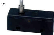
Extended Overtravel Plunger