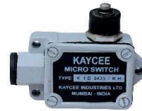
In Metal Encloser LH or RH