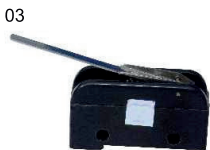
Plain Lever ( Direct Acting )