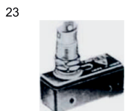
Panel Mount Roller Plunger