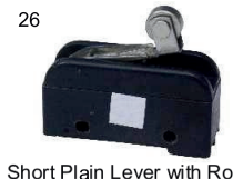
Short Plain Lever with Roller ( Reverse Acting )