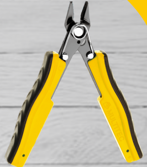
07 A Electra