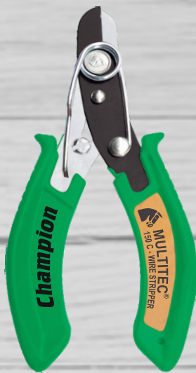
150 C Champion