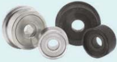
Extreme temperature bearings