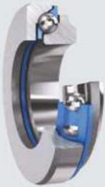
Solid oil bearing